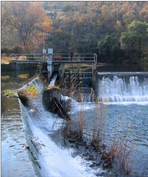
PG&E's Coleman Diversion Dam