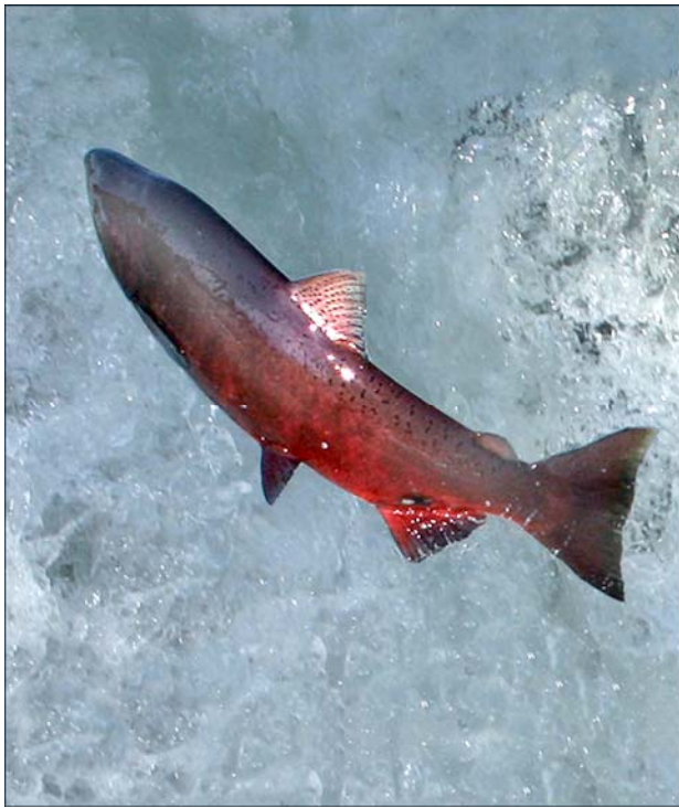
Chinook Salmon